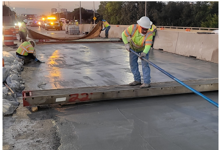
Texturizing concrete on DNT bridge over Lomo Alto Dr.