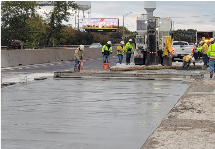
Concrete placement on DNT bridge over Lomo Alto Dr.