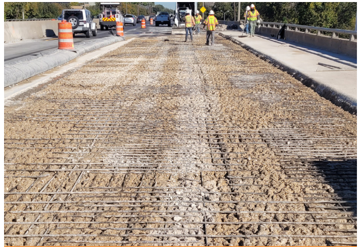
Concrete removal on DNT bridge over Lomo Alto Dr.