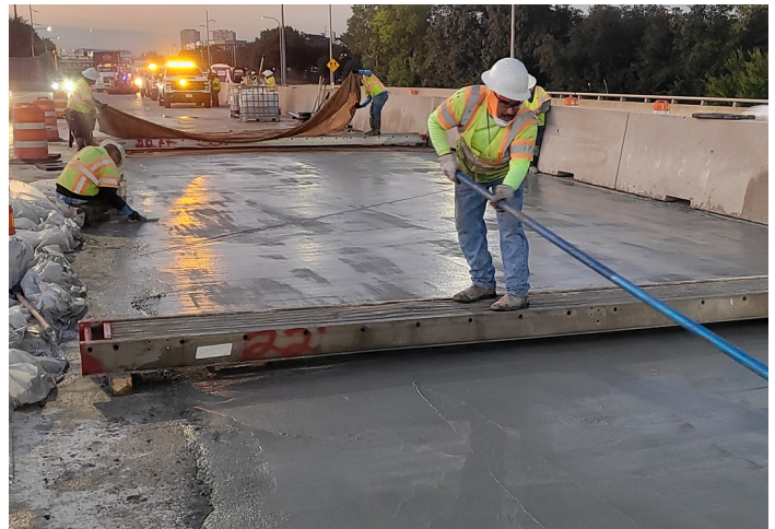
Texturizing concrete on DNT bridge over Lomo Alto Dr.