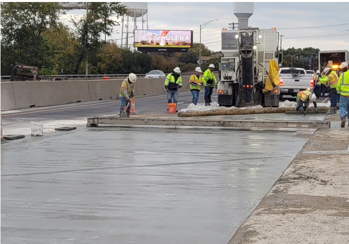
Concrete placement on DNT bridge over Lomo Alto Dr.