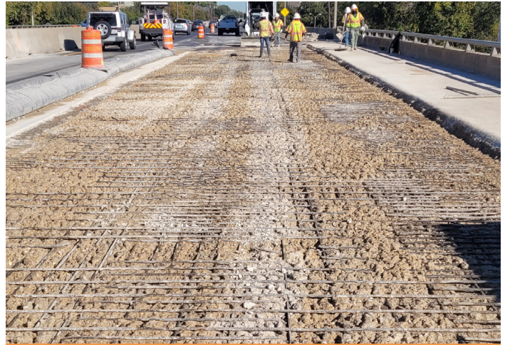
Concrete removal on DNT bridge over Lomo Alto Dr.