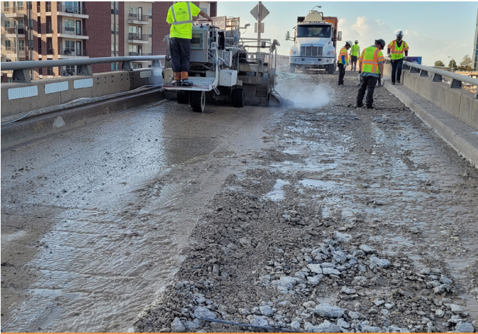
Concrete removal on northbound I-35E direct-connector