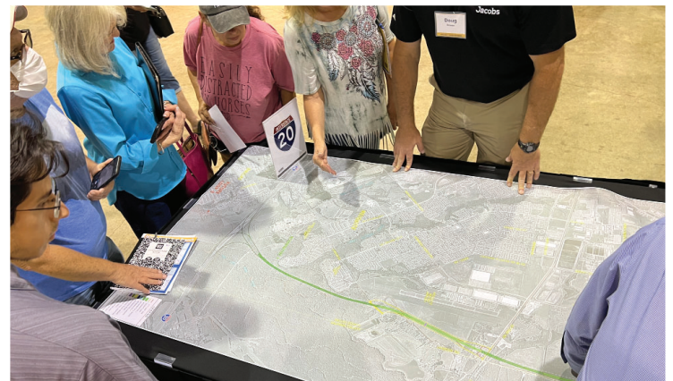
Attendees review map of possible alignment