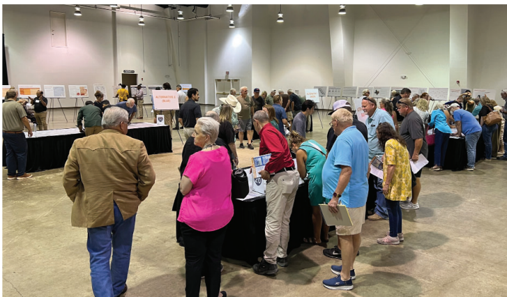
A public meeting was held on August 20 in Mesquite