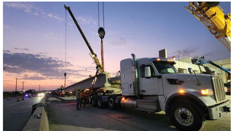
Delivery of bridge beams