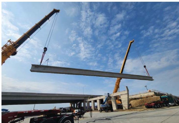
Beam placement for new DNT bridge at Fields Pkwy.