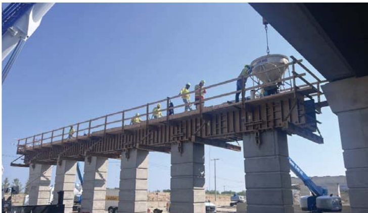
Concrete placement for new bridge over Fields Pkwy.