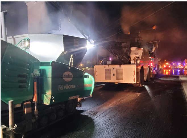
Placing new surface