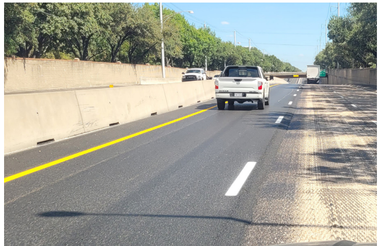
Left lane resurfaced