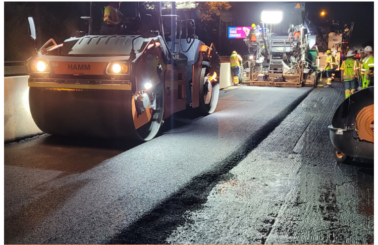
Placing new overlay on left lane