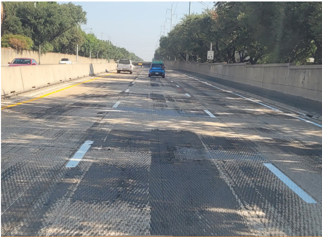
DNT ready for new driving surface