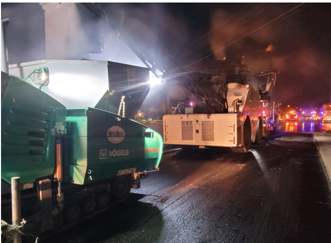
Placing new surface