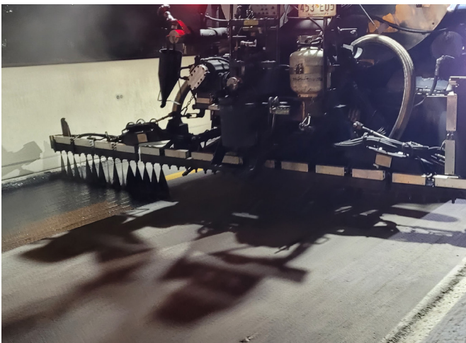
Placing subgrade ahead of new driving surface