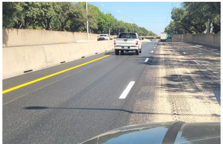
Left lane resurfaced

Have any project-related questions? Let's connect: 469-608-6880 or progressNTTA@ntta.org