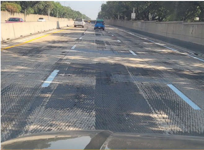
DNT ready for new driving surface