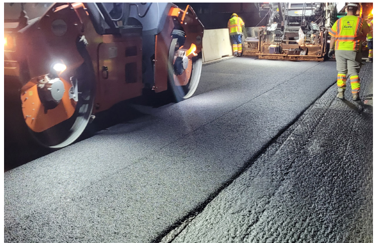
Placing new surface