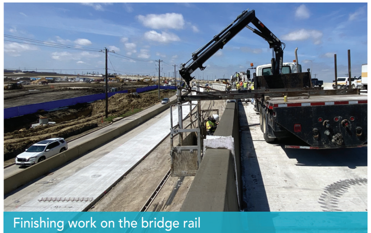
Finishing work on the bridge rail