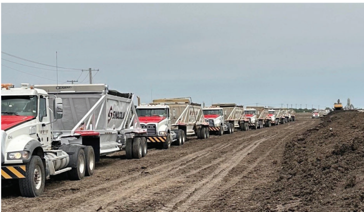
Hauling dirt for future mainlanes