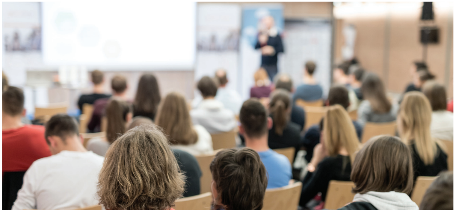
Public Meetings will be held to receive stakeholder input