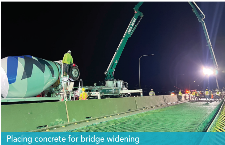
Placing concrete for bridge widening