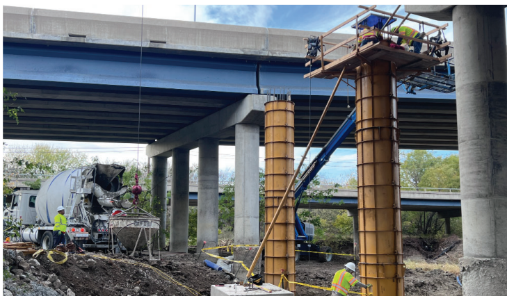
Concrete column construction