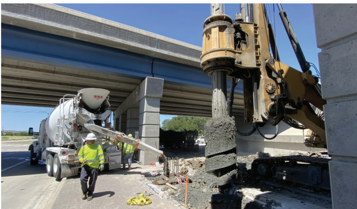
Concrete placement for column foundation