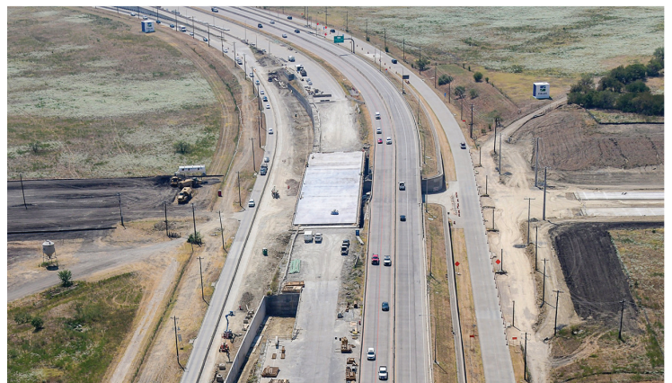
Reconstruction of DNT over Fields Pkwy.