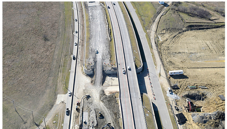
Reconstruction underway at Fields Pkwy.