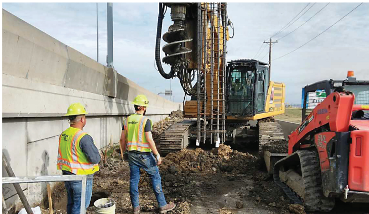
Placing steel for drill shaft foundation